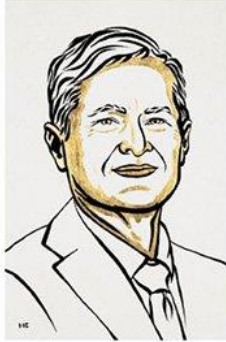
Ferenc Krausz