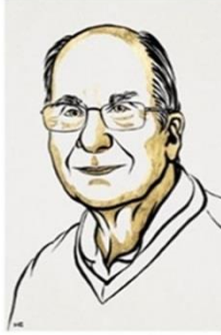
Louis E. Brus