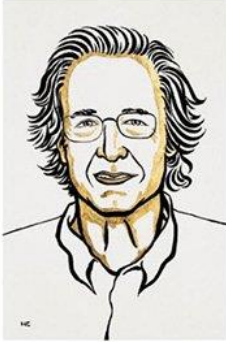
Pierre Agostini