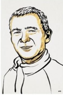
Mounji G. Bawendi

For the discovery and synthesis of quantum dots, Mounji G. Bawendi, Louis E. Brus, and Alexei I. Ekimov have been given the Noble Prize in Chemistry 2023. These nanoparticles have numerous uses in industries like electronics, cutting – edge surgery, and quantum computing.