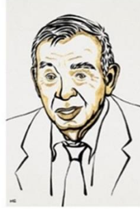
Alexei I. Ekimov