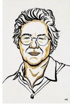
Anne L'Huillier

Pierre Agostini – France affiliated with ohio state university