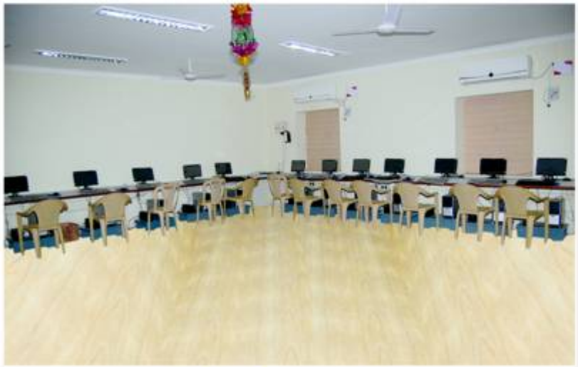
B.Sc. Computer Lab