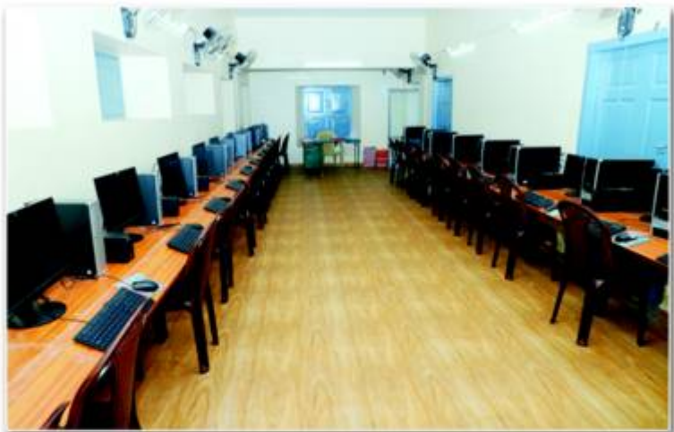
B.C.A. Computer Lab